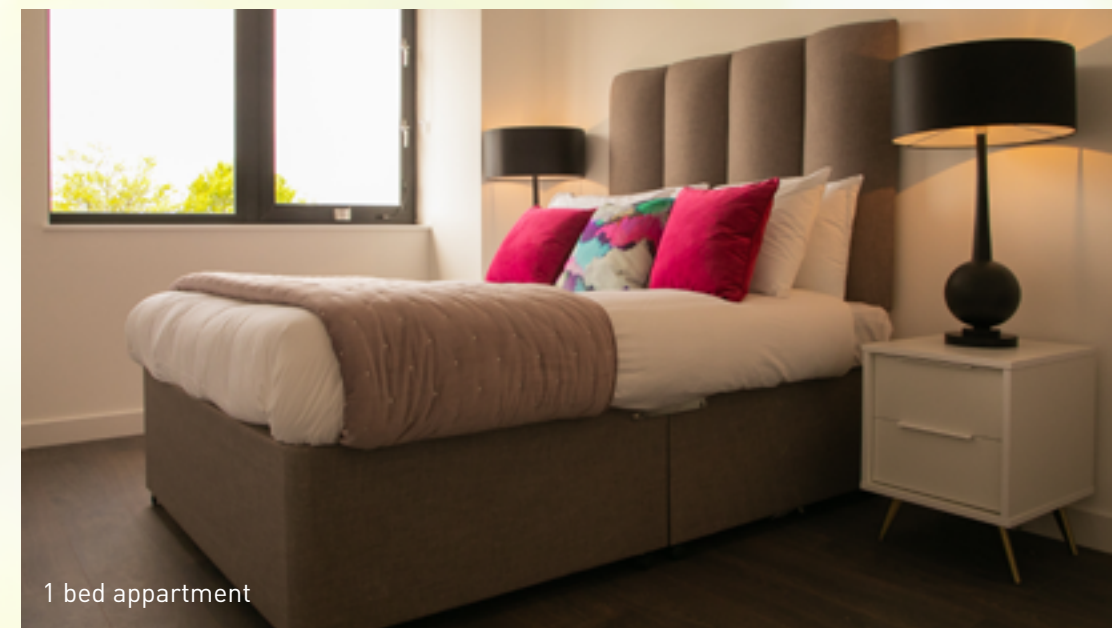
1 bed apartment