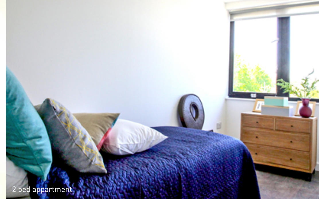
2 bed apartment